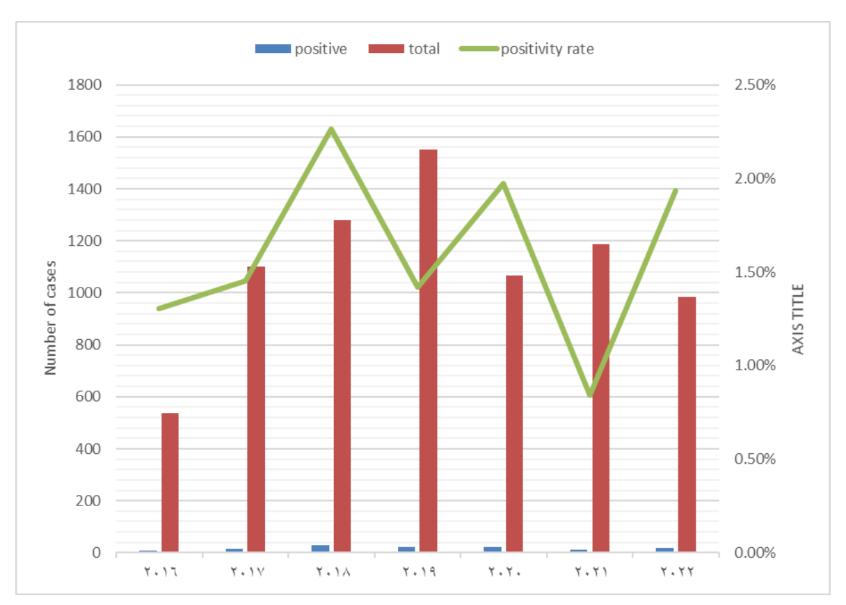
Figure (1): The TB-positive cases in relation to the total number of cases from 2016 to 2022.