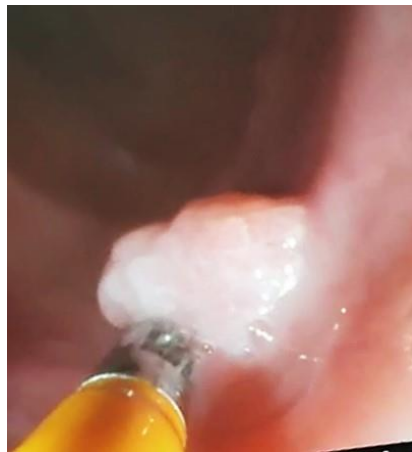
Figure (1): Esophageal papilloma.