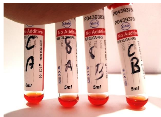
Figure 1: Uninoculated Carba NP test tubes used as control tubes labelled C (A and B) and inoculated Carba NP test tubes labelled 8 (A and B) giving negative results.

Both uninoculated control tubes (a and b) and the inoculated tube (a) were red to red-orange. If any color else was observed, the test was regarded as invalid. Red or red to orange inoculated tube (b) was negative for carbapenemase production (figure 1). Light orange, dark yellow or yellow inoculated tube (b) was regarded as positive (figure 2) [4].