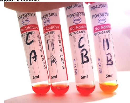
Figure 2: Uninoculated Carba NP test tubes used as control tubes labelled C (A and B) and inoculated Carba NP test tubes labelled 11 (A and B) giving positive results (yellow color).