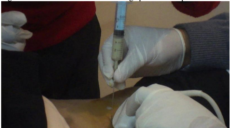
Figure 2: Ultrasound guided drainage with pus seen in the syringe