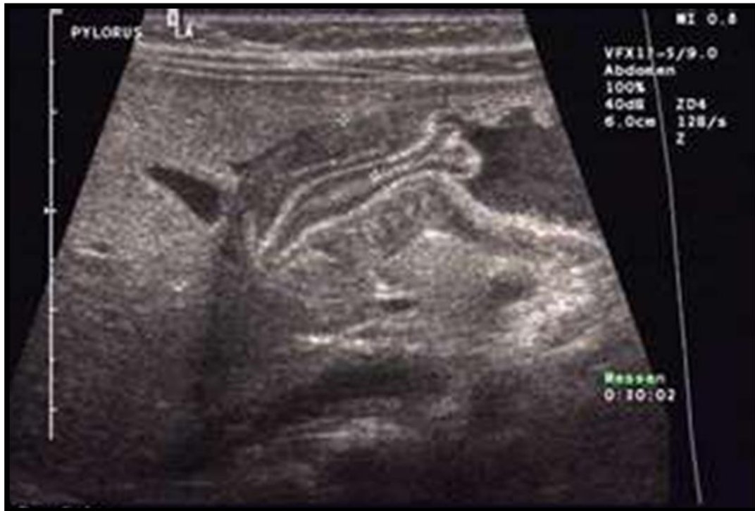
Image (1): Longitudinal ultrasound through a 2 months female infant showing an IHPS